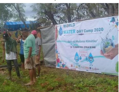
Participants at PERMATIL water camp

Over three days in March, PERMATIL (Timor-Leste's permaculture organisation) bought together youth representatives from eleven of Aileu's villages for a water conservation camp held near Cotolau, Laulara.