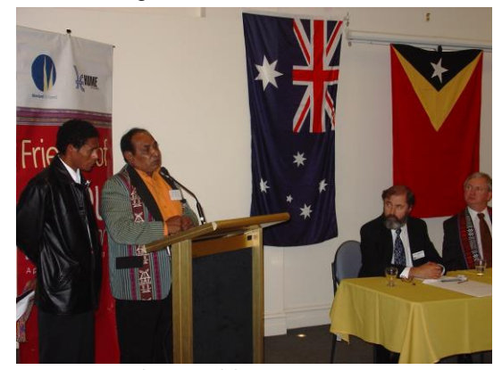
Renewing the Friendship Agreement, May 2005

The friendship, initially established with a Memorandum of Understanding signed on 4 May 2000, has since been periodically renewed with the signing of a Friendship Agreement between the two Councils and the Aileu Municipal Administration in 2005, 2010 and again 2016.