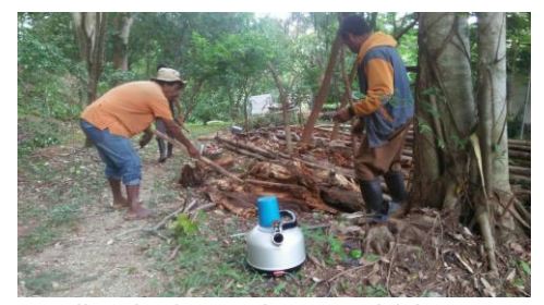
Village leaders working at Kadalak Dame

ARTC staff members have been working with the group of village leaders carrying out maintenance activities and installing more garden beds.