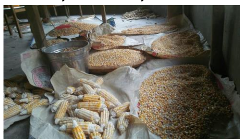
Drying the first maize crop from Kadalak Dame

They also harvested the first maize crop and will soon harvest the first soya bean crop. These foods, from the garden beds constructed by the village leaders and the CERES Global Timor 2019 team, will help establish a community food security reserve.