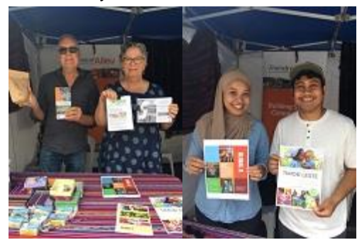
Moreland Community Gardening & CERES Global at Friends of Aileu stall

Thanks to CERES Global and Moreland Community Gardening who joined Friends of Aileu for a joint effort the Sydney Road Street Party on 1 March.