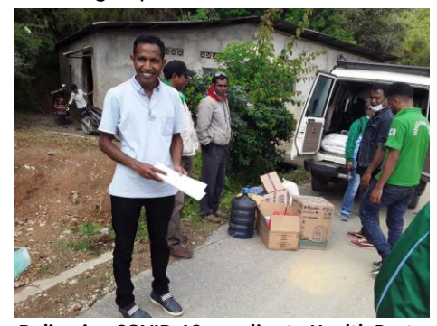
Delivering COVID-19 supplies to Health Posts

The Aileu community, supported by World Vison and Plan and others have established hand washing facilities and information sharing on reducing exposure to coronavirus.