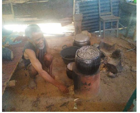
Community-based rehabilitation client using one of the new stoves

The St Francis Assisi Disability Workshop last year manufactured 230 small, safe fuel-efficient stoves for the Uma Ita Nian Clinic's community-based rehabilitation and nutrition program.