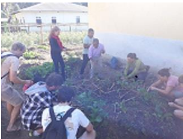
CERES Global at Mantane School Garden