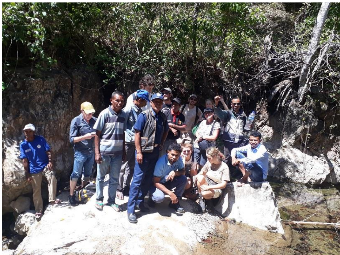
CERES Global Timor 2019 participants, with Suku Liurai leaders and community members, at the up-stream weir of the Dom Baumeta school and village water supply project