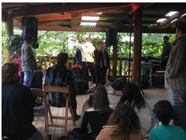
Grassroots Gathering fundraiser at CERES