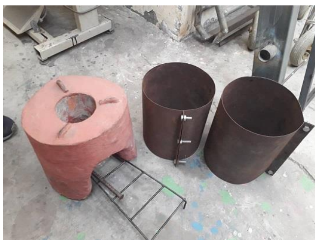
Uma Ita Nian Clinic Fuel efficient stoves

3.6.2 Community Health, Disability Support, Nutrition and Agricultural Livelihood activities, with the donation from Merri Health was used to provide financial contributions to: