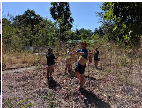
Maize and cassava field in dry season, Atekru, Atauro