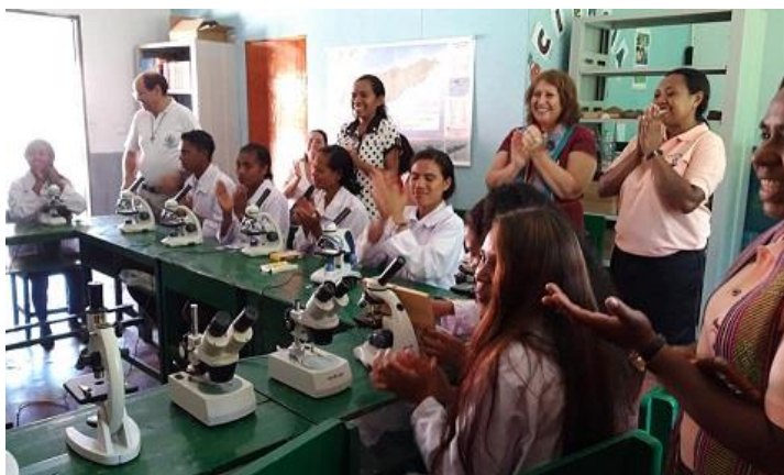
Aileu Science, Maths and Reading Contest Vida Saudavel students and teachers with new microscopes

The Aileu Anan Association completed its report on the interview survey of past beneficiaries of the Aileu University Scholarship Program, for which funds were provided in 2018, presenting the results to a local government and community forum in April and publishing the final report in October.