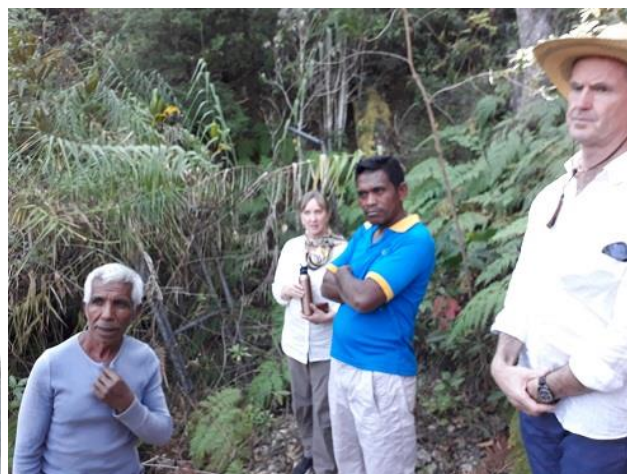
Manu Casa reforestation project