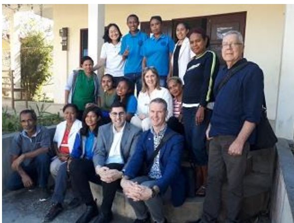
Delegation members with staff of Uma Ita Nian Parish Clinic