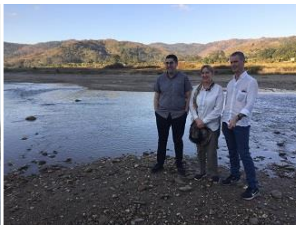
Returning to Aileu from Manu Casa, Lequidoe (in distant hills)

As part of its orientation to Timor-Leste, the delegation also visited: