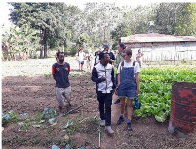
CERES Global participants:

contributing to Kadalak Dame garden project and discussing composting & mulching with local farmers