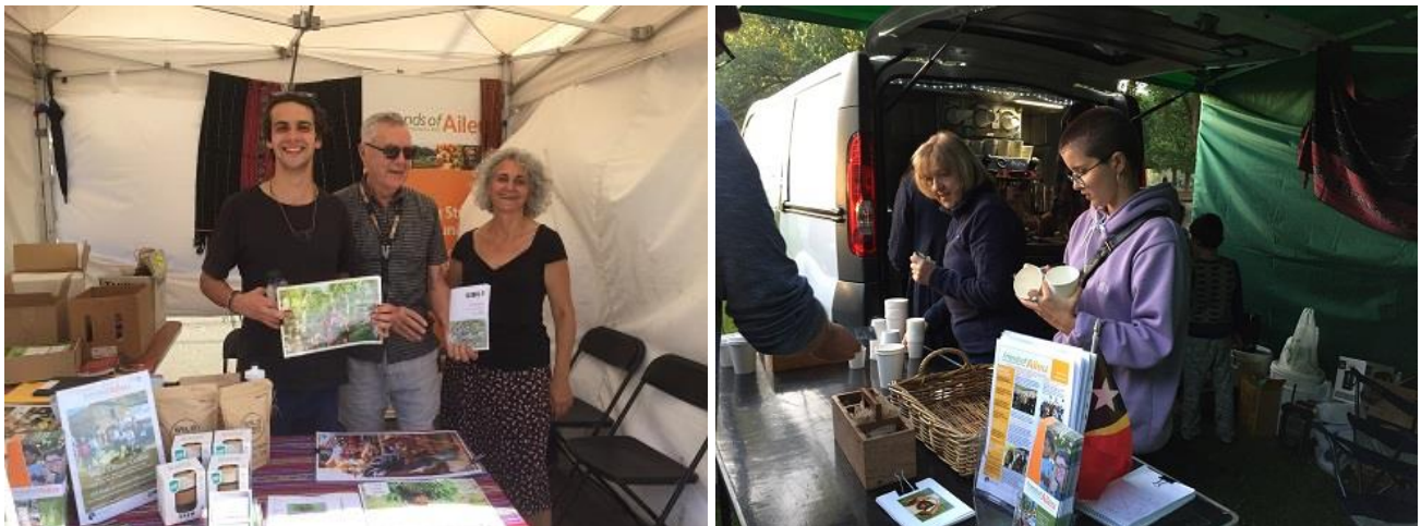
Volunteers and partner organisation representatives at Sydney Road Street Party and Coburg Carols