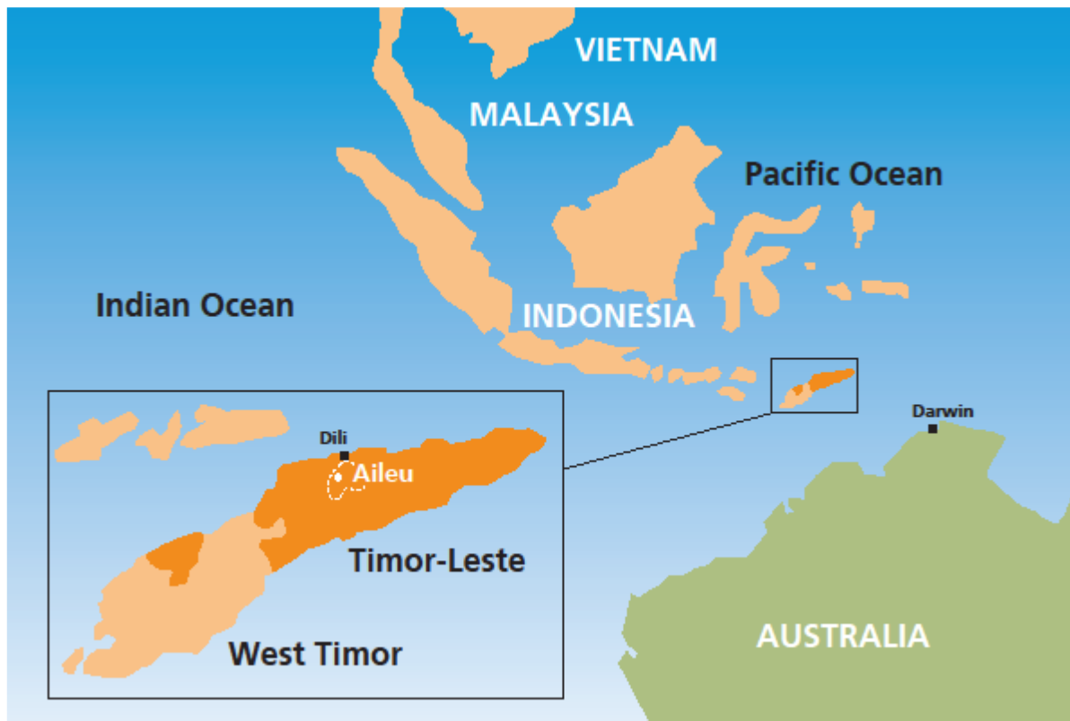
Timor-Leste: one of Australia's nearest neighbours