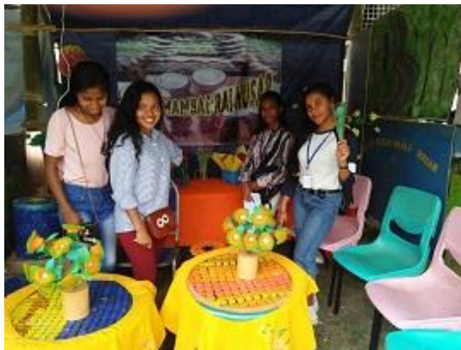
Arte Mambai Rai Husar exhibition at Aileu Expo

These events, donations and other activities, including the sale of Wild Timor Coffee and Kor Timor products, raised funds to support the work of our Aileu partners, including the Aileu Municipal Administration and government departments, Aileu Resource and Training Centre, Uma Ita Nian Parish Clinic, Aileu Anan Association, Rotaract Club of Aileu, Aileu Municipal Youth Centre and Arte Mambai Rai Husar.