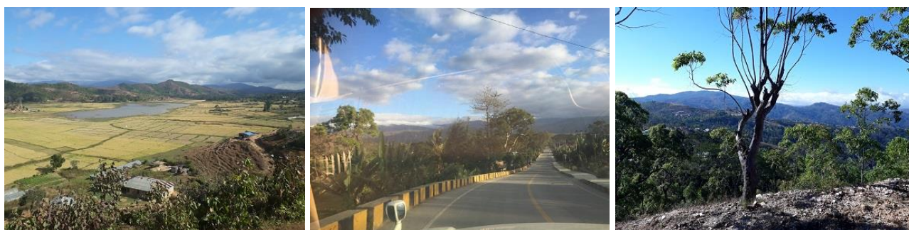
Seloi lake and agricultural area - Newly reconstructed highway through Aileu - Lequidoe drier highlands

The signing of these agreements took place in conjunction with delivery of the 13 th Maurice Blackburn Oration on The Importance of Community Alliances in the Re-Building of East Timor , by Xanana Gusmão (then President of the National Council for Timorese Resistance) at Coburg Town Hall on 4 May 2000.