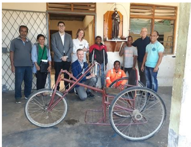
Uma Ita Nian Clinic's St Francis disability workshop