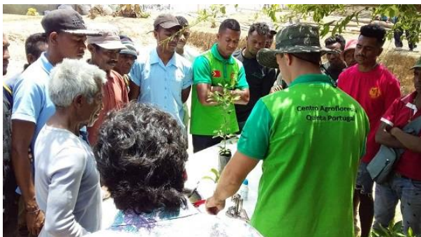
ARTC and Manu Casa community nursery