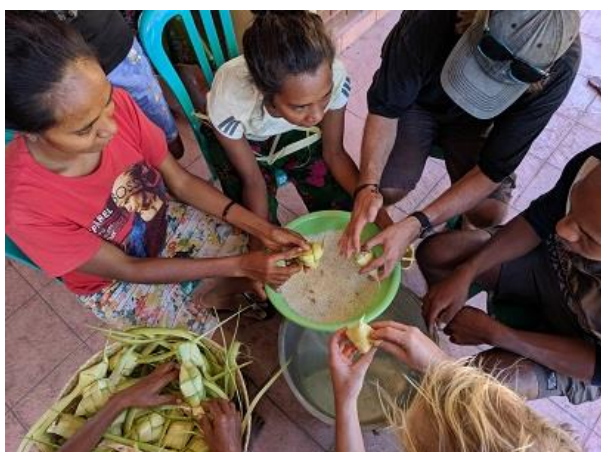
Preparing catalpa (rice cakes) in Atekru, Atauro