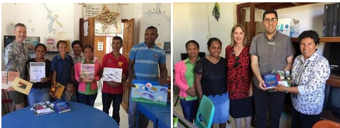
Delegation members at Aileu Resource and Training Centre library, presenting: Educational materials from Prime Scil (Swinburne and Monash) and Stories of Friendship Groups and Australian East Timorese families

The councillor members of the delegation gained valuable first-hand experience of the conditions, development challenges and progress in Timor-Leste and Aileu, including in relation to Friends of Aileu sponsored activities. They also developed personal connections amongst partner organisation representatives and community members, and gained a better understanding of their lives, work and aspirations for the future.