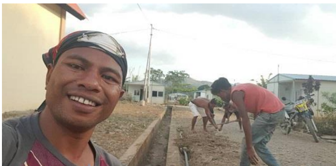
Dom Baumeta community laying pipes for water project

3.6.3 CERES Global sustainable agriculture, school and community gardens trip (see also 3.9), with this year's visit including: