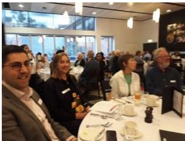
One of the Friends of Aileu tables AETA dinner