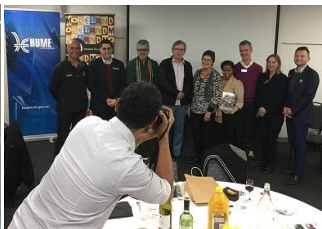
Guest speakers and Councillors May Dinner & Forum