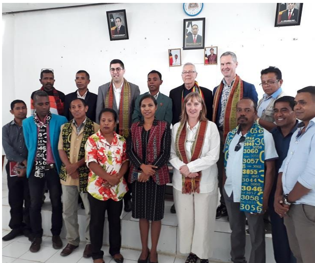
Delegation members with the Aileu Municipal Administrator (centre rear row), Municipal staff and Directors of Government Departments