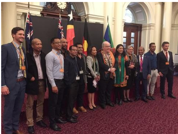
Guests at reception for Ambassador Abel Guterres