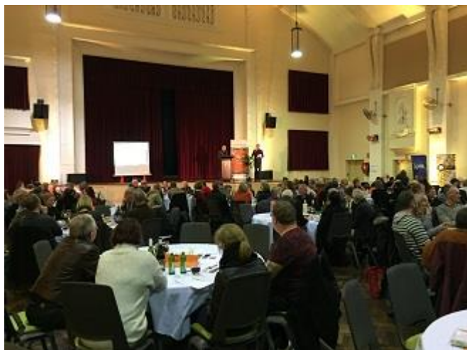
Trivia Night fundraiser, Coburg Town Hall

Major Friends of Aileu events in 2019 included the third annual Grassroots Gathering-CERES music fundraiser, the annual Dinner and Forum, the annual Trivia Night fundraiser and a film night fundraiser at Cinema Nova, Carlton. Friends of Aileu also participated in several of Moreland and Hume City Council's community festivals.