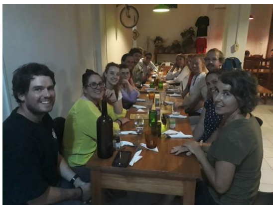
CERES Global participants first evening meal together