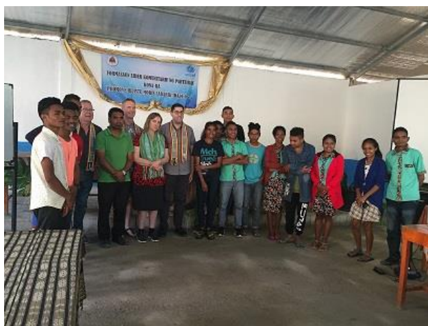
Council – Friends of Aileu Delegation: At Ministry for State Administration and at Aileu Municipal Youth Centre