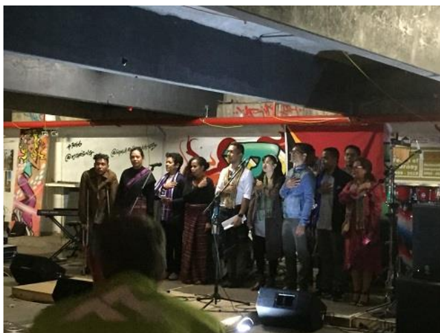
Timorese students at Independence Day celebration