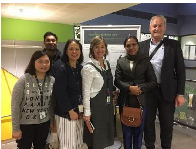
Oral Health team, North Richmond Community Health