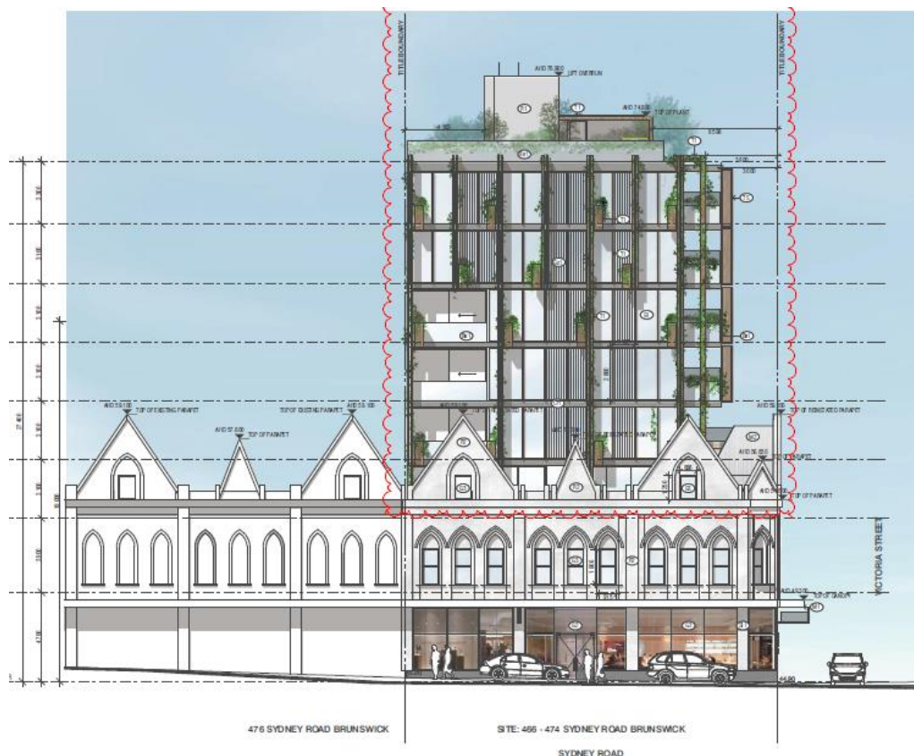
Image 3. Proposed west elevation - Sydney Road frontage.

However, when viewed from the opposite side of Sydney Road, more than a quarter of the tower will occupy the vertical angle as the top of the parapets do not represent a true reflection of the streetwall height, at image 3 below.