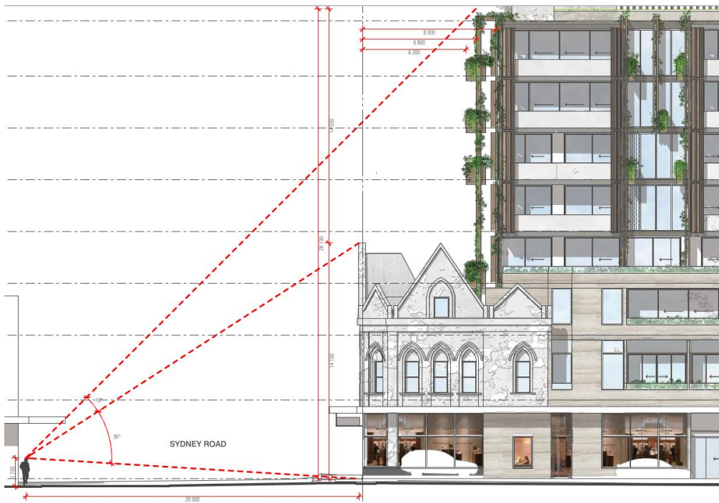
Image 2. Proposed southern elevation – Victoria Street Frontage with DDO site line.

However, when viewed from the opposite side of Sydney Road, more than a quarter of the tower will occupy the vertical angle as the top of the parapets do not represent a true reflection of the streetwall height, at image 3 below.