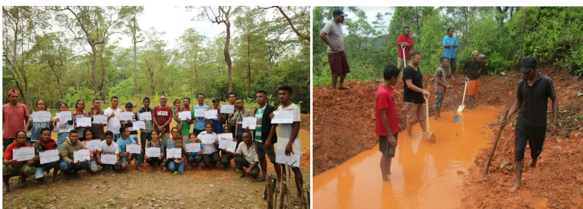
Trainees receiving certificates / PERMATIL water conservation camp / Creating recharge pond