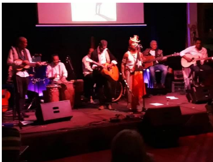
Maubere Timor (FALANTIL veterans band) in Brunswick