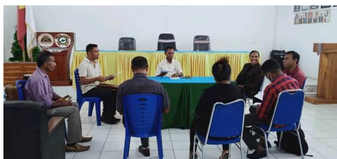
Aileu Commission discussing scholarship program