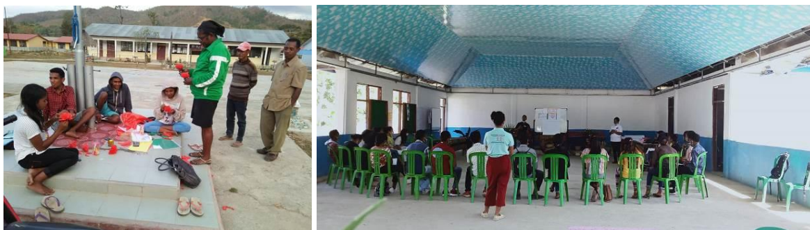
Arte Mambai Rai Husar recycling waste / Classes in Peace House, Municipal Youth Centre