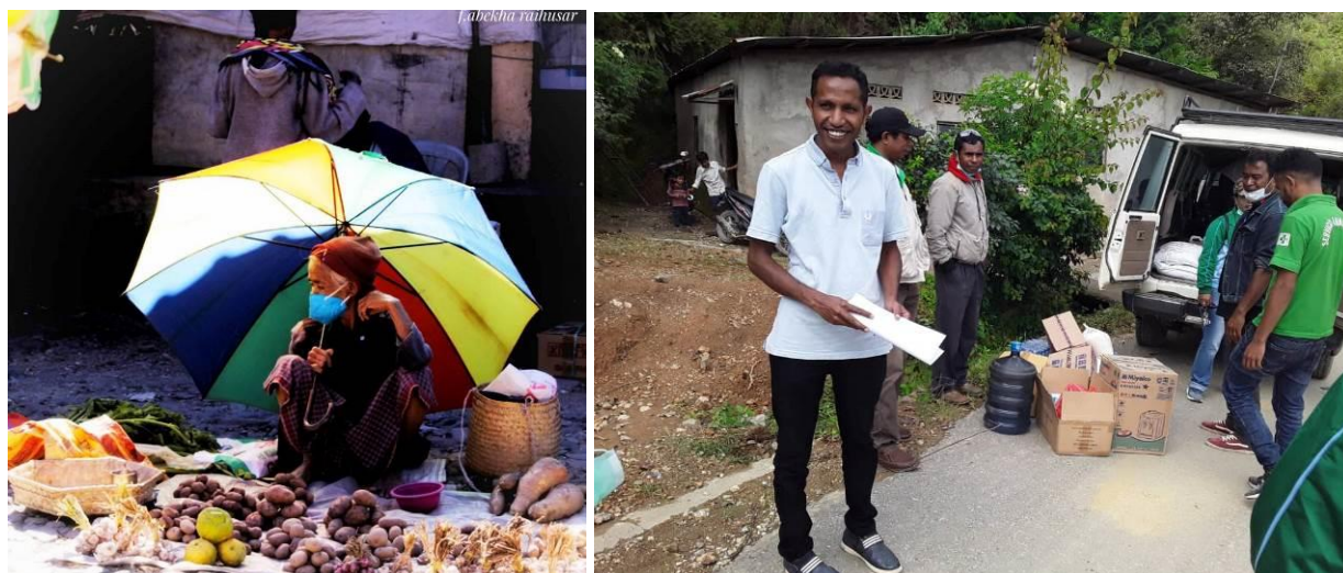
COVID-19 pandemic: Trader at Aileu market / Aileu Health staff delivering relief supplies

The Australian Embassy and Department of Foreign Affairs and Trade (DFAT) played a major role in supporting the Timor-Leste Ministry of Health manage the COVID-19 pandemic. Friends of Aileu was able to support several of the many community outreach and relief efforts undertaken by health authorities and community groups in Aileu.