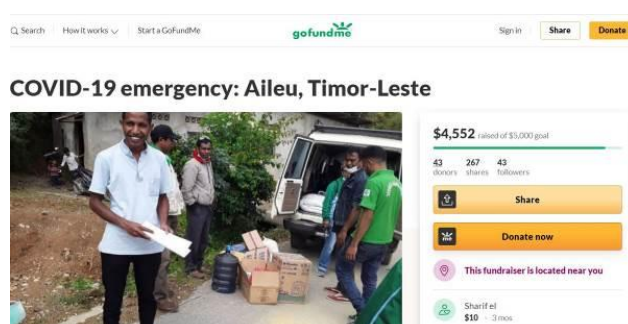
Virtual meetings and internet-based fundraising