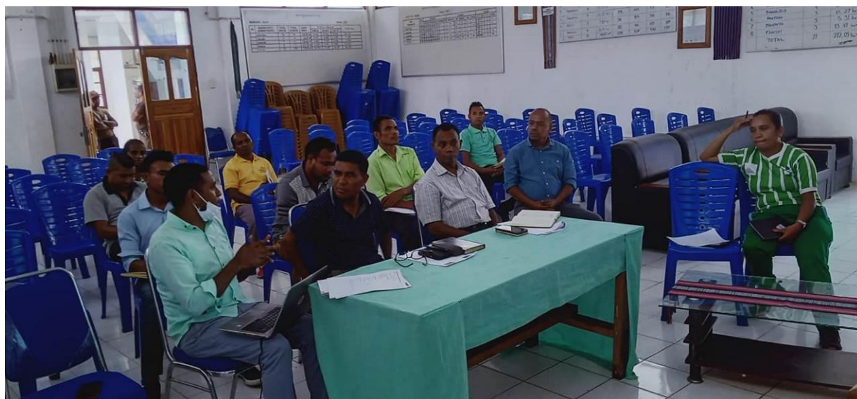
Meeting of the Aileu Friendship Commission

A significant development was the reconvening of the local government and community committee which advises the Municipal Administrator and oversees friendship activities in Aileu.