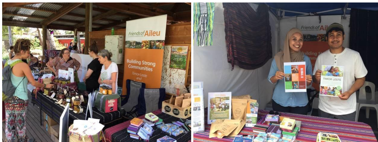
Friends of Aileu at CERES Gathering for Aileu Sydney Road Street Party (with CERES intern)

Friends of Aileu's program for 2020 got off to a good start on 16 February, with the fourth annual CERES Gathering for Aileu , organised by the Grassroots Gatherings community in collaboration with CERES and Friends of Aileu. Participants shared music, culture, food and stories of friendship and raising funds for the youth development activities in Aileu - for more details .