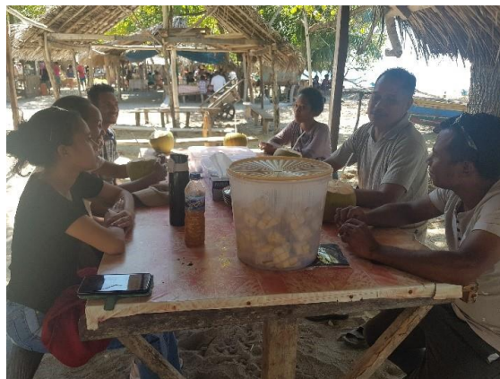
New rubbish bin at ESTV / Rotaract Club of Aileu / Study tour group Atauro eco-resort