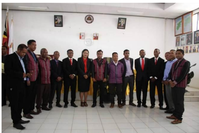
Aileu Municipal Administration staff members

In Aileu it is anticipated that new appointments to senior local government positions, including Municipal Administrator, Municipal Secretary and Departmental Directors/Managers, will be finalised by the Timor-Leste Government by early 2021. Preparing for and responding to the gradual decentralisation of service responsibilities to the municipal level and development of capacities to establish representative democracy will continue to be priorities for the Aileu Municipal Administration.