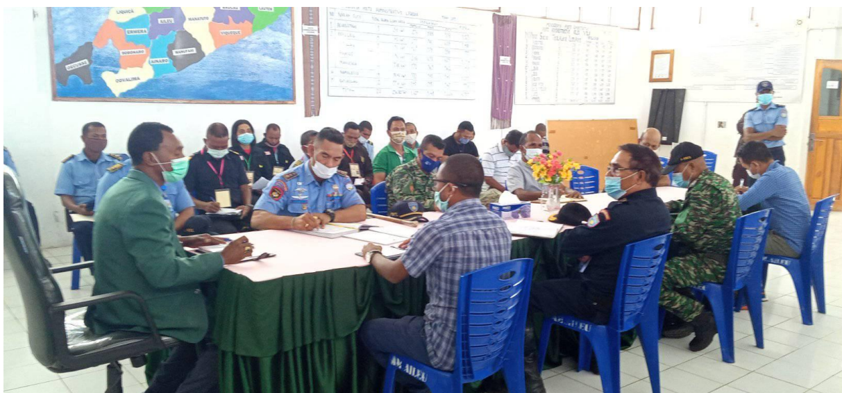
Aileu Municipal pandemic response committee