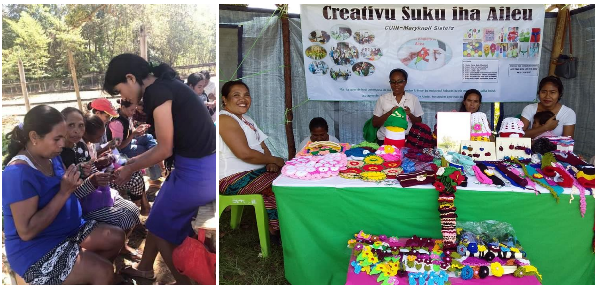
Learning new skills / Uma Ita Nian women's sewing group / Exhibition at Aileu Expo 2020