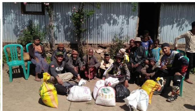
Volunteer trainers and Aileu health workers MOSSA delivering COVID-19 relief packages