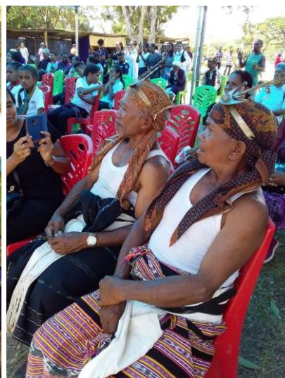
Aileu Expo 2020