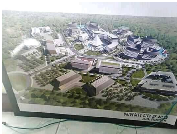
Plans for the future Aileu University City