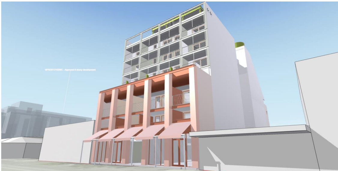
Figure 2 – Sydney Road streetscape perspective from the south-west (massing of eight-storey approval at 200-216 Sydney Road seen far left).