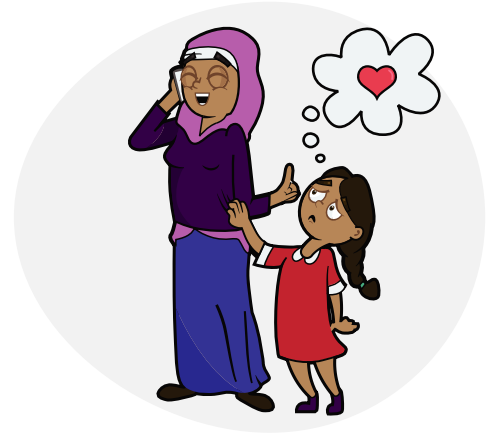
Not showing a child love and attention