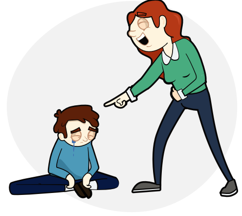
Teasing or being mean to a child