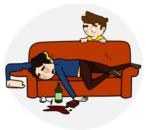
Being intoxicated in front of a child