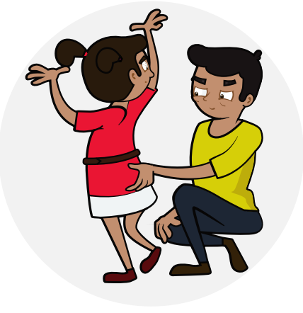
Touching a child's private parts