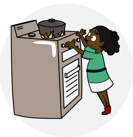
Leaving a child without adult care