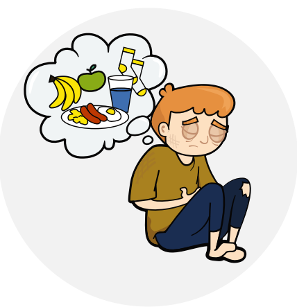
Not providing enough food, clothing or medical needs for a child