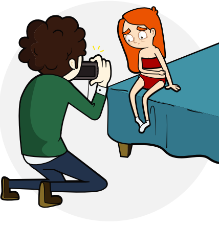
Taking sexual photos or videos of a child