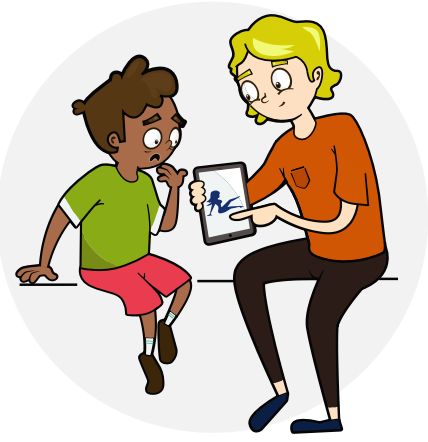
Showing pornography to a child