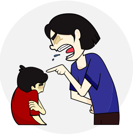
Yelling at or threatening a child