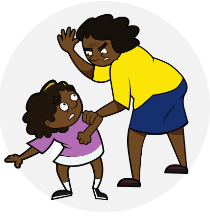
Hitting or hurting a child's body